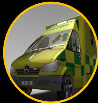
Redesigning the Emergency Ambulance