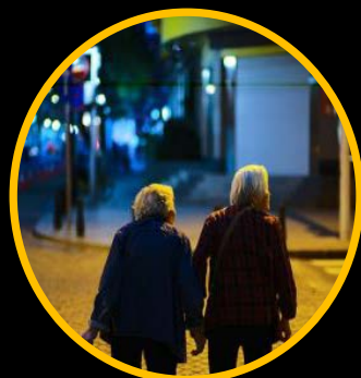
Pioneering Architecture for Later Life Sector (PALLS)