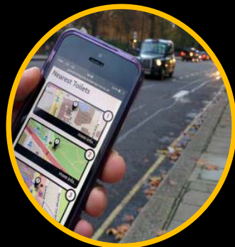
The Great British Toilet Map