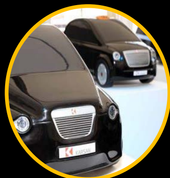
Advanced Taxi for London