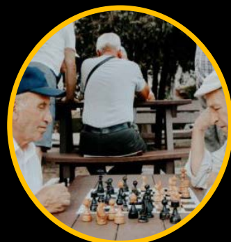
Design Age Institute