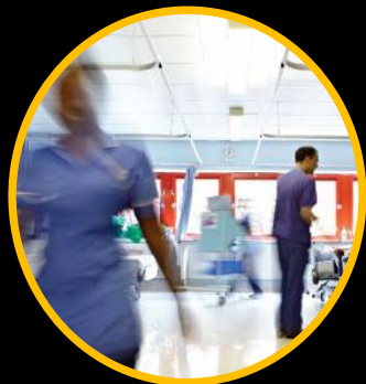
Designing out Medical Error