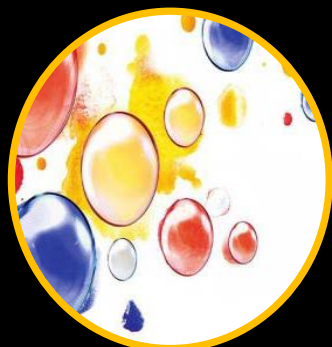
SloMo: Digital support to improve wellbeing and thinking habits