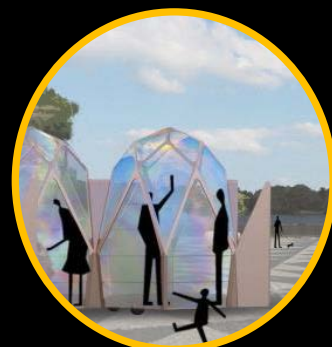
Our Future Foyle